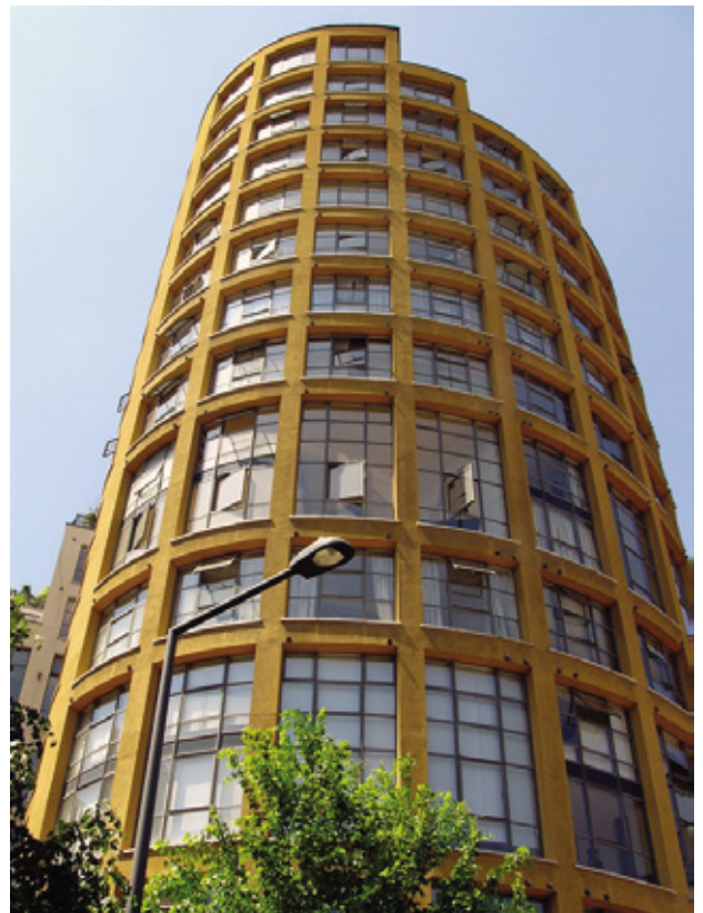
Bankside Lofts, London se 1 Architects : CZWG

The system has been approved by the BBA (Certificate No. 90/2437) and by the Institute of Bautechnikin Germany. They are also registered with the Insulated Render and Cladding Association (INCA).